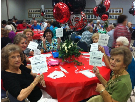
Senior attendees "cooling off" with their Vital Link fans