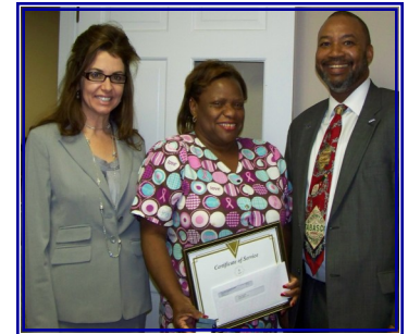
Shirley Williams 04/27/2010